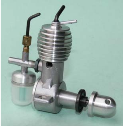
MPJet Classic .040/ 0,6cc

PLEASE NOTE ALL PRICES ARE SHOWN IN AUSTRALIAN DOLLARS (AUD) PRICES AND DESCRIPTIONS ARE SUBJECT TO CHANGE WITHOUT NOTICE