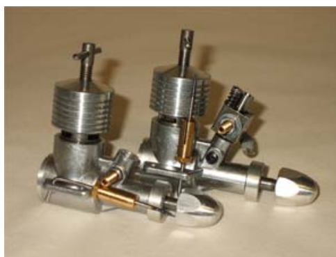
PAW 049 BR (0.8cc) &amp; 06 BR (1cc) Std and R/C

PAW Diesels are made in England and we have sold PAW Engines for over 30 years. All represent excellent value for money. The range is very extensive and includes engines from 0.55cc to 10cc, in PB (plain-bearing), BR (single ball-race) and TBR (twin ballrace) versions. Most are available in either Standard or R/C versions. 09 and larger R/C engines are fitted with R/C throttle and compact PAW silencer. There are also specialised engines for Goodyear and Combat. Owen Engines stocks only a small selection of the PAW range and reasonable spares, but all are readily available.