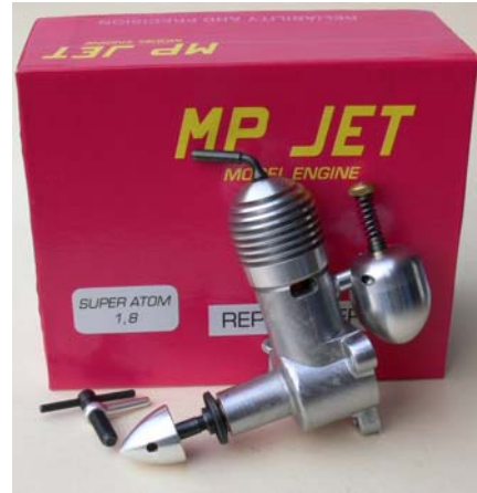
MPJet Super Atom 1,8cc Diesel

MPJet Engines are made in the Czech Republic by a firm which has established an enviable reputation for small glow & diesel engines over the last 25 years. All carry a conditional Six Month Warranty and are supplied properly boxed and with full instructions. Each Classic engine includes standard 2cc and large 3cc alloy FF tank bowls and a special safety spinner, plus an additional 2-page set of specific instructions, based on my own experience. A full range of spare parts for the Classic is held in stock. The Letmo 2,5cc and the replica 1,8cc Super Atom are fine, vintage-type long-stroke engines, ideally suited to old timer and vintage FF and RC models. Additional mounting details are included.