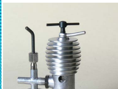
NEW 'T' Compscrew on MPJ 0.6cc