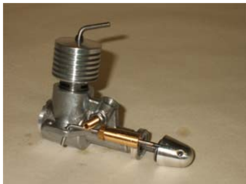
PAW 55 BR (0.55cc) Std Diesel