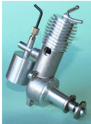
MPJet Letmo MD-2,5cc